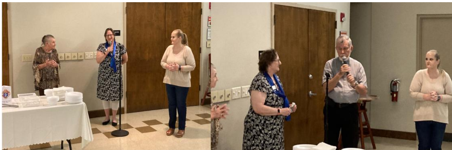
Sunday September 22 Holy Spirit CCW welcomes the new Holy Spirit Knights of Columbus with a luncheon after the 11 am