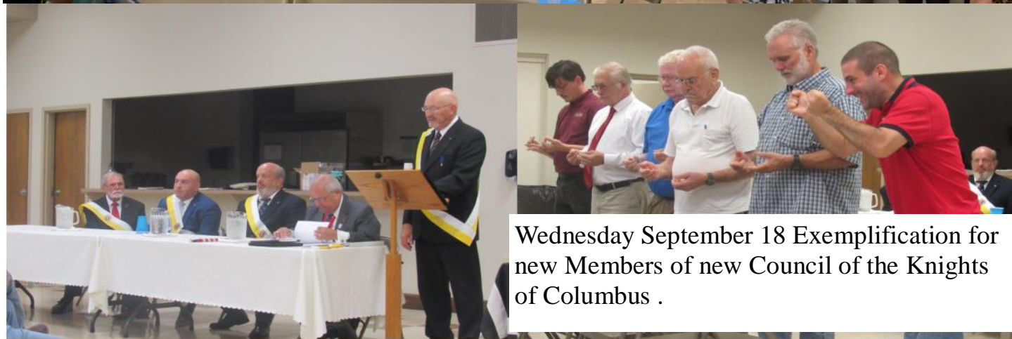
Wednesday September 18 Exemplification for new Members of new Council of the Knights of Columbus .